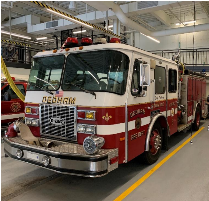
1994 E-One Pumper