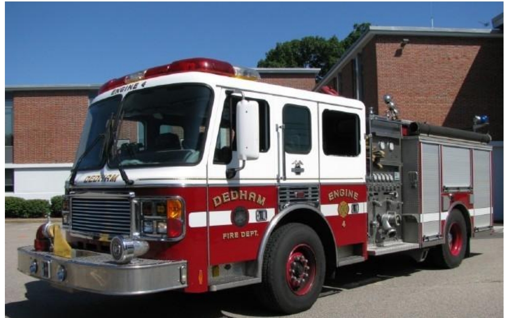
2000 American LaFrance