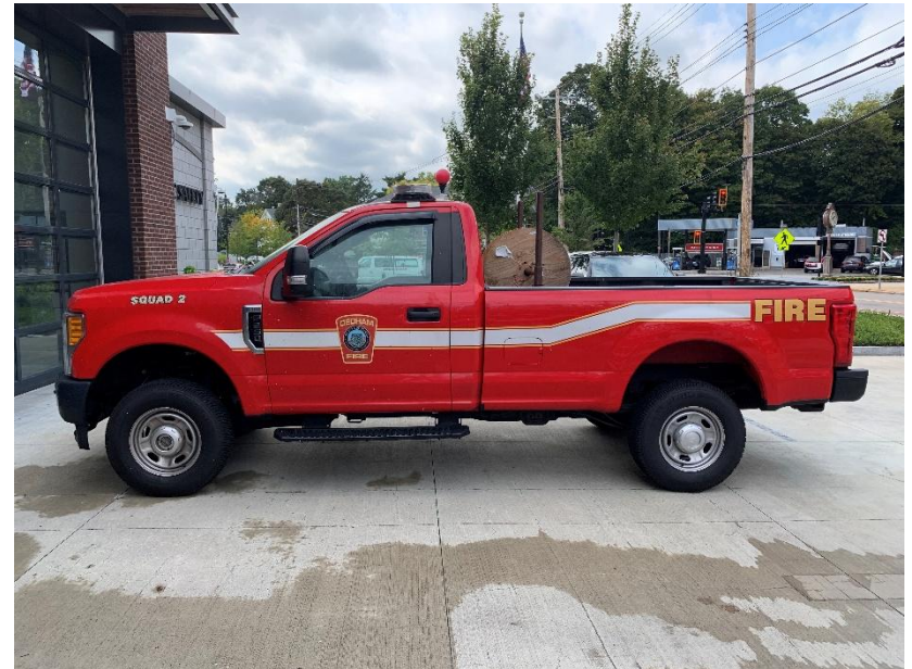
2015 Ford F-250